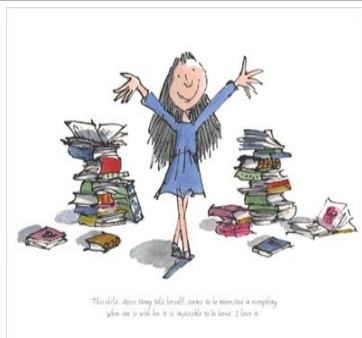
Lunch in a book.