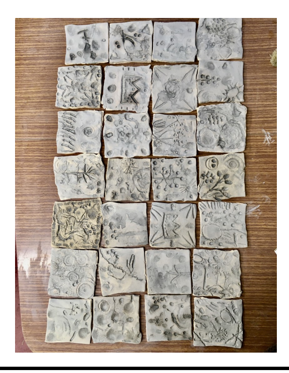
Tiles ready for 2nd firing