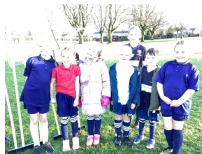
The sun was shining that much it blinded the camera!

These events are a great opportunity to meet up with and get to know children from our other Federation schools as well as those from local primary schools.